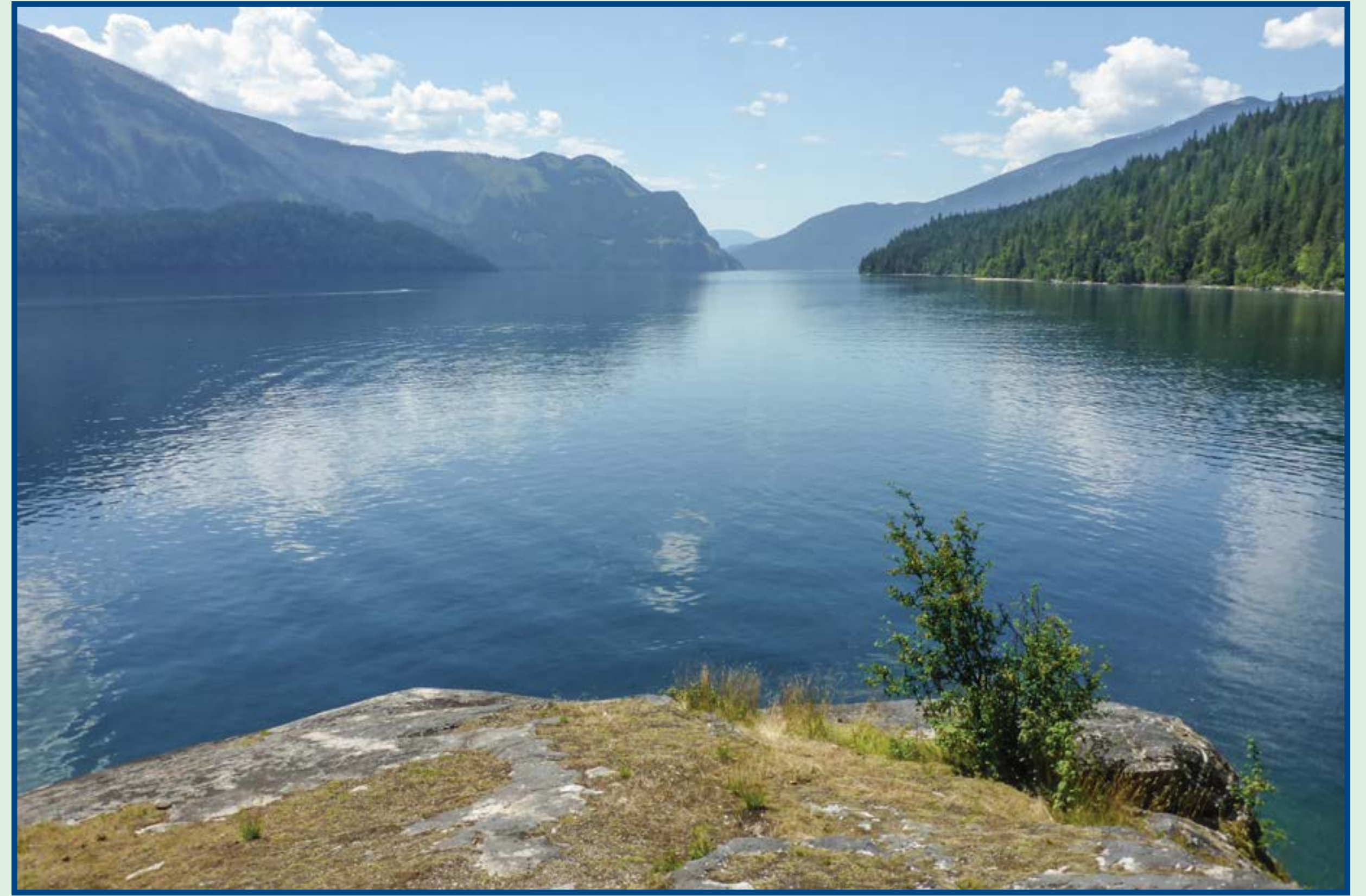
The shoreline of Beautiful Slocan Lake