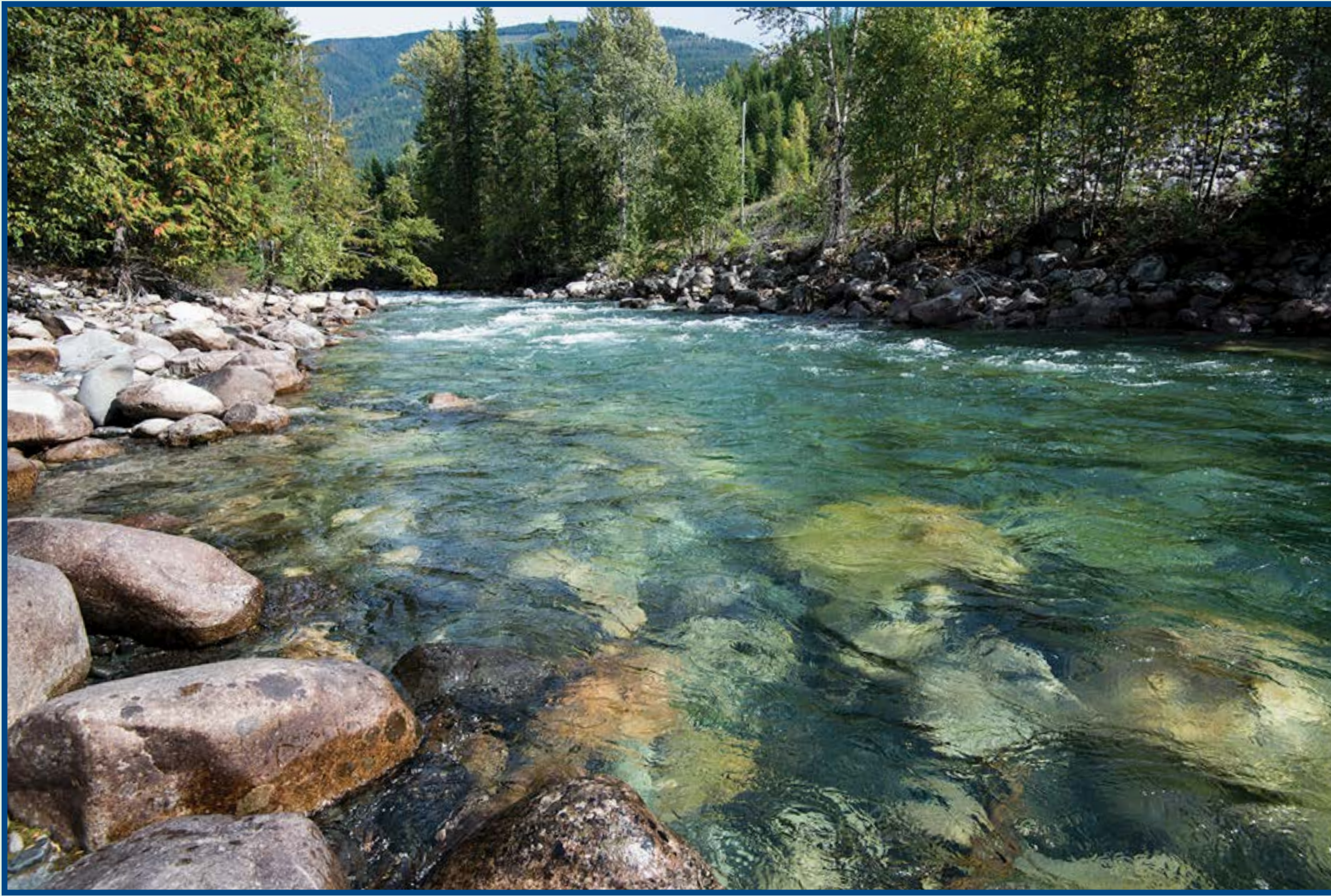
Wilson Creek as seen from Rosebery Provincial Park