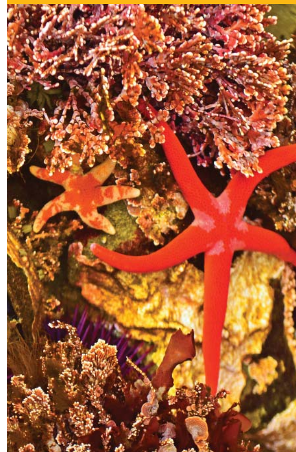
Tidepool at Botanical Beach